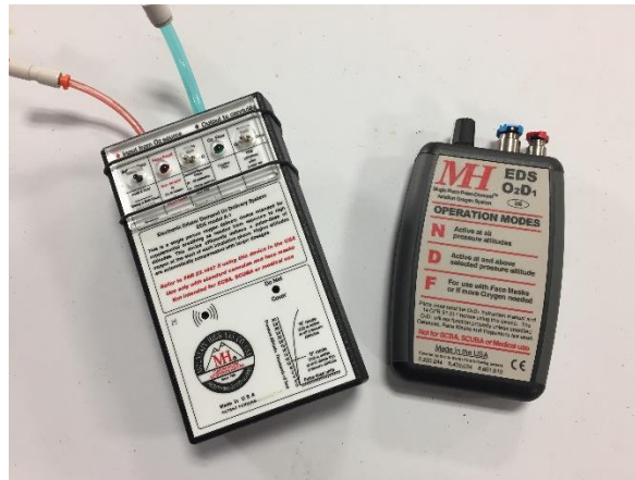
Figure 1, Mountain High EDS units, original A-1 vs latest O2D1

The latest version of the Mountain High pulse demand O2D1 controller has been susceptible to EMI providing false triggers and oxygen delivery. This is unique to the latest version, a compact SMT design. The older analog units did not exhibit this sensitivity.