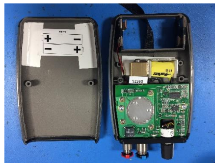
Figure 7, EDS unit partially reassembled

This has resolved the false triggering that had been taking a toll on oxygen range over the last two years. Somewhere in the evolution from analog to low voltage digital, a sensitivity to radiated 1090MHz emissions was introduced.