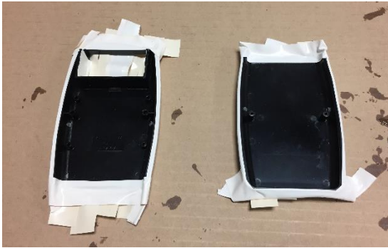
Figure 5, Masked Enclosure

example, were in close proximity to the case and could potentially make contact if they moved or slid out of position.