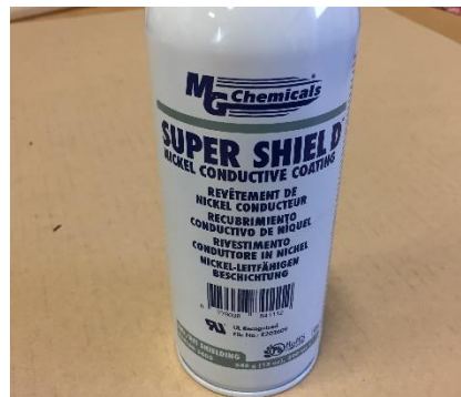
Figure 4, MG Super Shield Conductive Coating

The final solution needed to be more aesthetically pleasing than aluminum foil wrapped around the exterior. I coated the interior of the plastic enclosure with a spray-on nickel based EMI shield. While not as opaque as a full wrap of aluminum foil, it was sufficient to shield the EDS electronics.